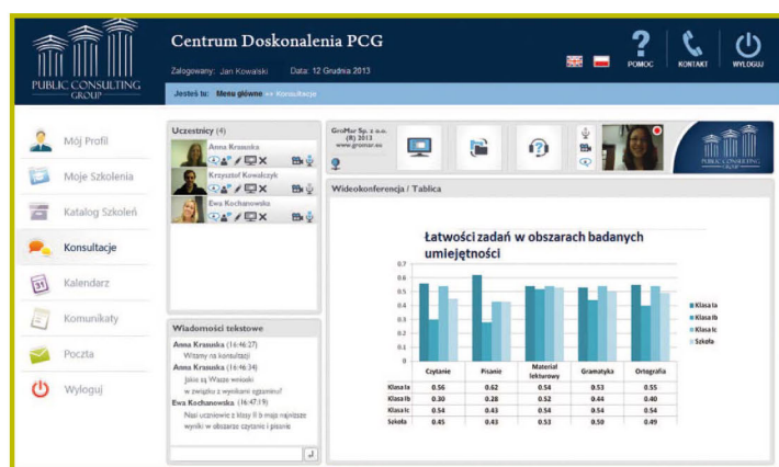
PCG Professional Development Center's e-Platform, Live consultations