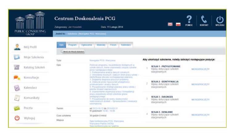
PCG PDC e-Platform, the tab courses